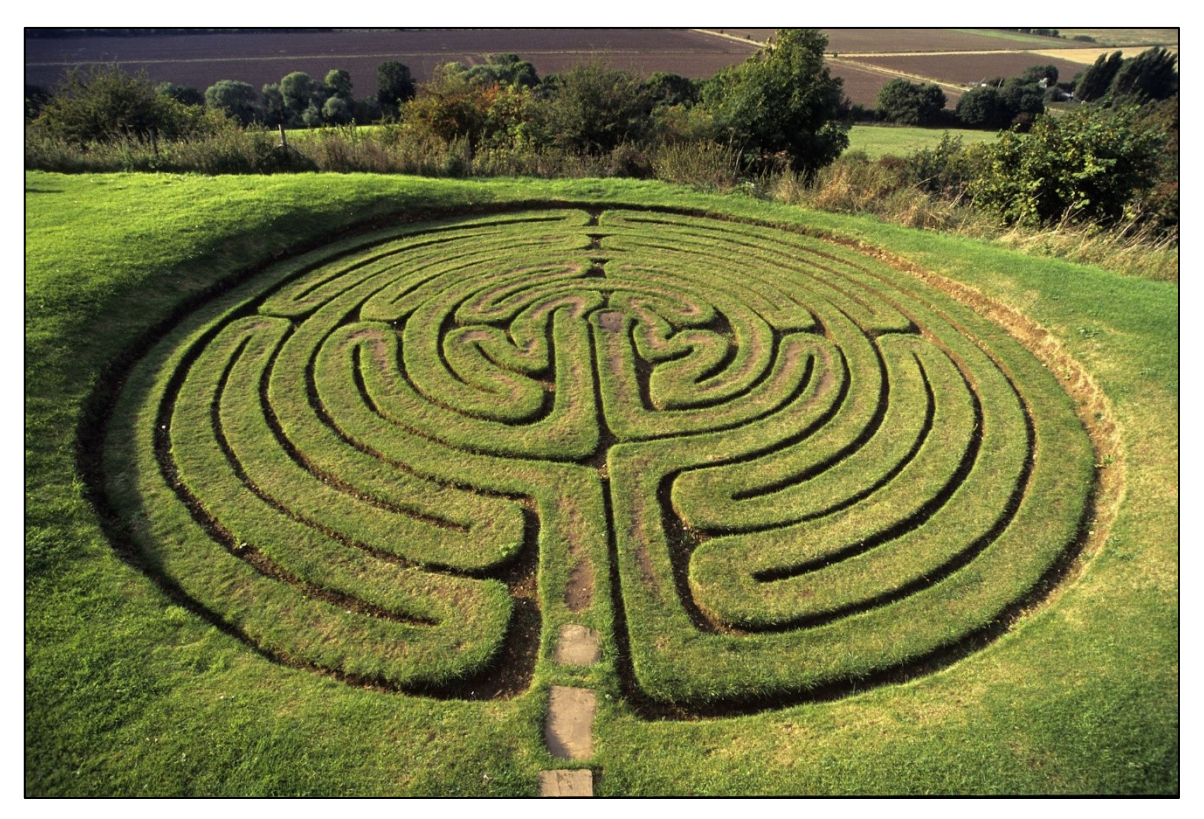
Figure 1: The Julian's Bower turf labyrinth, Alkborough.

If it is accepted that de la Pryme saw two mazes at Appleby, and therefore also at Alkborough, the number of known turf maze sites in Lincolnshire goes up from four to six.